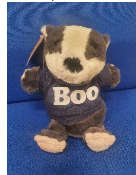
Year 2 and Year 6!

We've had a fabulous start to the school year, with everyone on top form, on time, focused and ready to learn. Therefore, deciding who Boo stays with for the week has been a tricky decision. However, for setting a fabulous attitude and showing responsibility to others, the oldest pupils in each key stage are the lucky recipients. Boo will visit more classes next week!