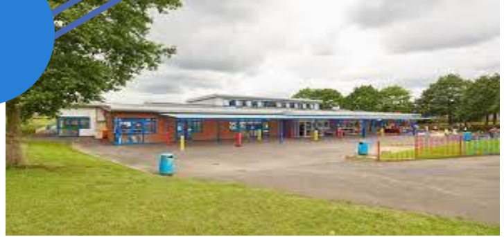
Newsletter – June 28th 2024

On Monday 20 th May, I had a very important phone call! We had been awaiting the call from Ofsted for a very long time and actually it was a relief when it finally came. The inspection begins then with long conversations with the HT, Deputy Head and other members of SLT. Timetables are sent over outlining the intentions of what will happen and when including interviews with subject leaders, staff, children, governors and advisors from the LA. Staff also knew when inspectors would visit their classrooms to watch them teach. All of this began at 8am on Tuesday 21 st May and ended at 6pm on Wednesday 22 nd May. Children were also chatted to informally by inspectors at playtimes and lunchtimes. The children passionately shared their pride about the roles they have to help our school run showing care, courtesy and consideration. Children were interviewed at length about their curriculum, what they learn, what they have learned previously and also about their behaviour, the behaviour of others and their own personal growth and development. Inspectors were really impressed with the things they were told by them all!