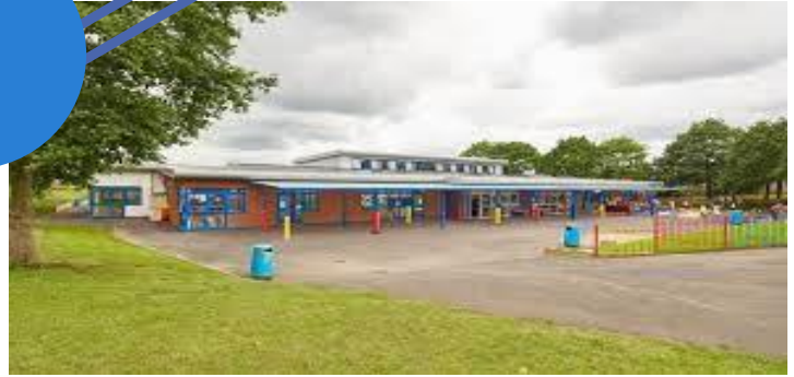
Newsletter – March 1st 2024