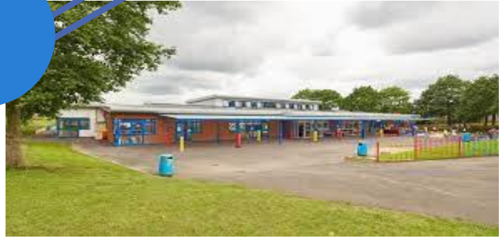
Newsletter - March 3rd 2023