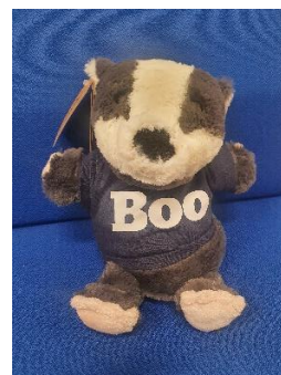
Year 2 MC/JO and Year 4 -TA