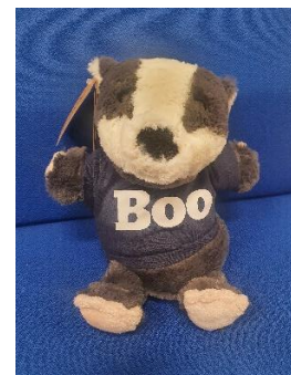
Reception – PR EN and Year 4 -IP